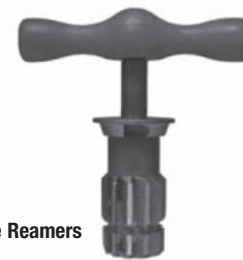
3/4" and 1" T-Handle Reamers